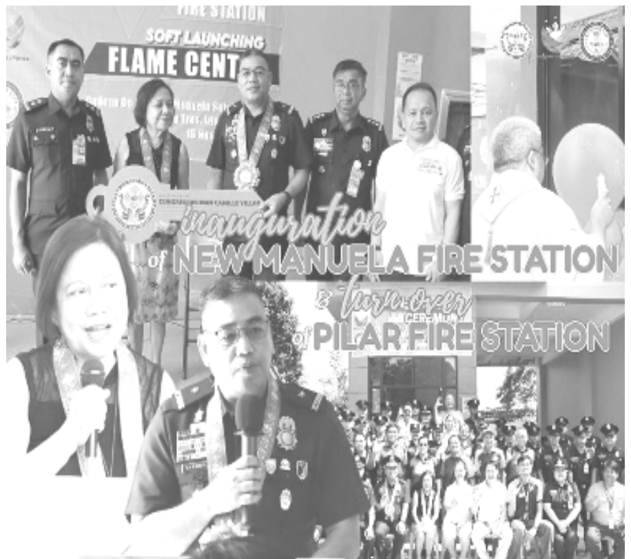
FLAME TRAINING CENTER LAUNCH & TURN OVER OF PILAR FIRE STATION – A new era of fire safety in Las Piñas City has begun with the inauguration of the New Manuela Fire Station and the turnover of the Pilar Fire Station on November 15, 2024. These projects were made possible through the generous support of Senator Cynthia A. Villar and Congresswoman Camille A. Villar. Notably, the New Manuela Fire Station has become the first FLAME Training Center in the country, offering simulation-based training, such as fire, earthquake, flooding, road accidents and other types of disaster to young students. BFP-NCR Director C. Supt. Nahum B. Tarroza, the Command Group and Las Piñas City Fire Director Josephus A. Alburo led the inauguration ceremony.