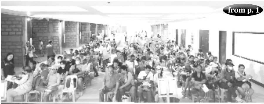
from p. 1