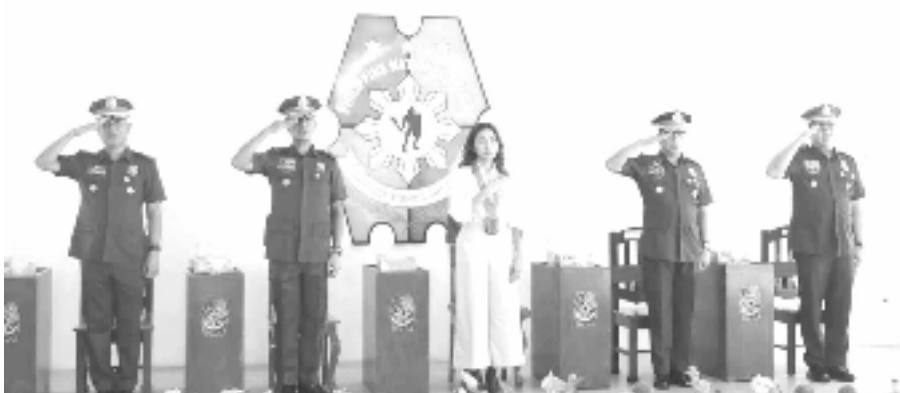
from p. 1