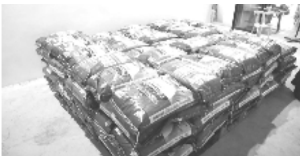
Sacks of rice donated by MPT South and Maynilad