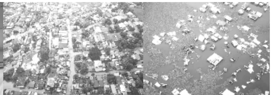
Nagsagawa ng aerial inspection si Pangulong Ferdinand Marcos Jr. upang masuri ang lawak ng pinsalang iniwan ng bagyong #KristinePH sa lalawigan ng Cavite, Laguna, at Batangas noong nagdaang Biyernes, Oktubre 25