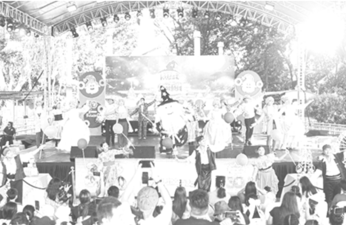
EK Eldar's Birthday Parade

and ViewTrue Imaging. For more information and updates regarding EK's forever