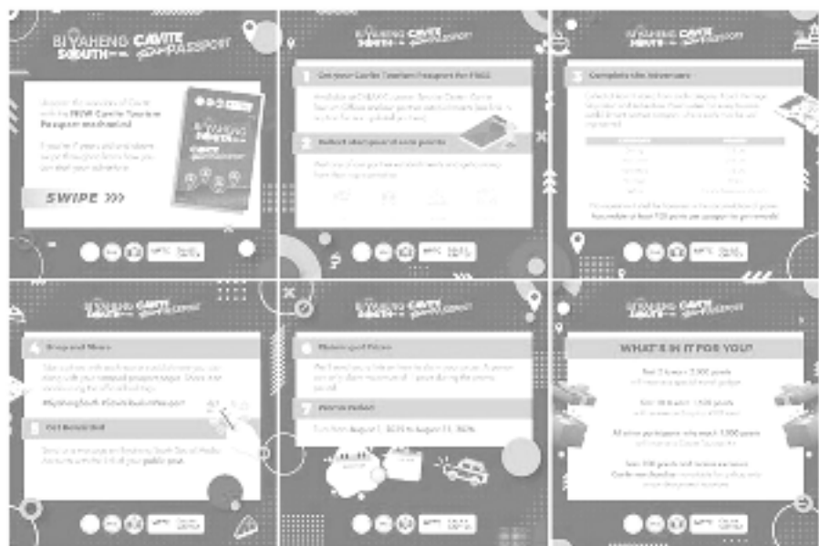
Compilation of Mechanics for the new Cavite Tourism Passport

I tching for a road trip, a weekend food crawl, or just a new place to unwind? Cavite is the perfect place to explore—as this time, the journey comes with rewards. Whether you're craving countryside views, cozy staycations, rich history, or local eats that hit the spot, Cavite has it all. And thanks to the return of the Cavite Tourism Passport, you won't just experience the best the province has to offer—you'll earn points, prizes, and bragging rights while doing it.