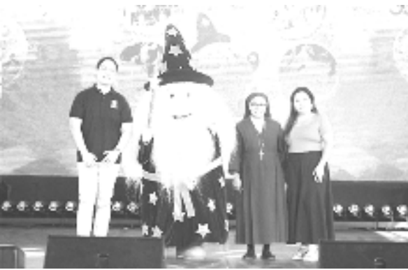
EMBB The Enchanted Story of Eldar the