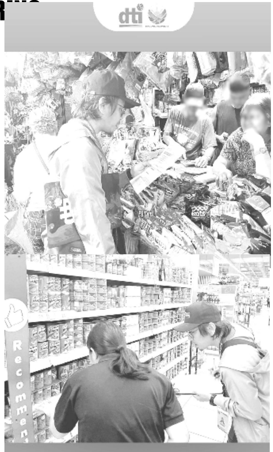
toring. DTI Cavite from p. 1

DTI-Cavite reaffirms its commitment to safeguarding consumer welfare and ensuring fair and stable pricing of essential commodities throughout the entire SOC period through conduct of continuous price and supply monitoring.