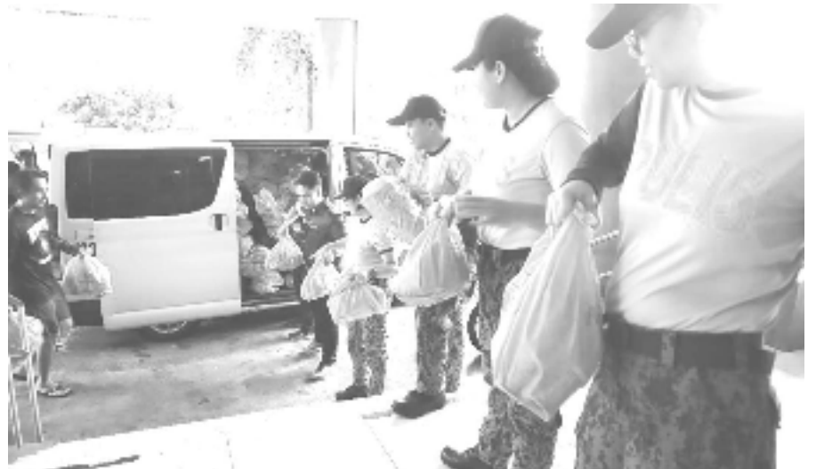
MPT South, LGU employees, and personnel of the Philippine National Police demonstrated "Bayanihan" for the displaced families in Kawit, Cavite

SOUTHERN SPARKLE NEWS AND PUBLISHING publication is an English/Filipino Weekly Published every Monday at Region IV-A, Province of Cavite