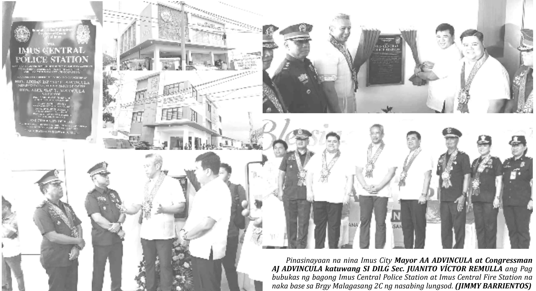
Pinasinayaan na nina Imus City Mayor AA ADVINCULA at Congressman AJ ADVINCULA katuwang SI DILG Sec. JUANITO VÍCTOR REMULLA ang Pag bubukas ng bagong Imus Central Police Station at Imus Central Fire Station na naka base sa Brgy Malagasang 2C ng nasabing lungsod. (JIMMY BARRIENTOS)