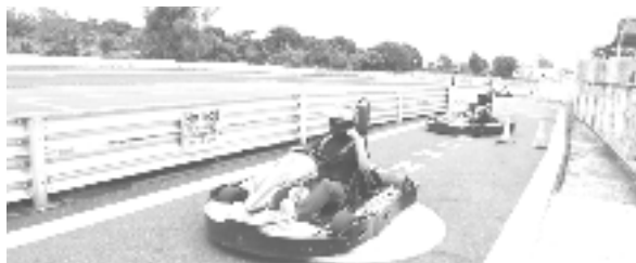
Ka-Biyaheros racing at Carmona Racetrack

clusive preview of the soon-to-open Governor's Drive Interchange, a key access point set to launch this 2025, which will extend CALAX's operating segment to Governor's Drive in General Trias, Cavite. This upcoming interchange is expected to decongest traffic on major roads in Cavite and significantly reduce travel time to key destinations like Carmona, General Trias, and Silang. The participants then headed to Kura Café in General Trias, Cavite, which is just a short drive from CALAX Silang-Aguinaldo exit. The group was welcomed with specialty brews and morning pastries while basking in the charm of this local favorite. One of the café's best sellers is their pizza, specifically the Nutella with pistachios—a delightful fusion of sweet and savory. Other must-try dishes in their menu are beef quesadilla, oyster sisig, baked scallops, and banana bread. **How to get to Kura Café: From Manila, you can either take Manila-Cavite Expressway (CAVI-TEX) southbound or go via SLEX and CALAX. From here, continue driving along Gover-