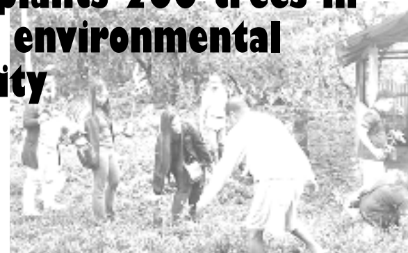
The CARD RBI team, with the members of the Barangay Kapatalan Council and a DENR representative, carried out a tree planting activity, reinforcing their commitment to environmental protection and conservation.