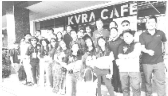
Breakfast and coffee at Kura Café

these sites by sharing their journey across their social media channels. Foton Philippines served as the official mobility partner, providing Ka-Biyaheros with comfortable rides, and the event is also sponsored by Kura Cafe, “more than just coffee.” Ka-Biyaheros journeyed for three days and two nights, experiencing a curated escape designed to highlight the region's unique charm, coastal attractions and cultural flair made more accessible via CALAX and CAVITEX. Breakfast and Scenic Drives in General Trias The adventure kicked off with a scenic drive along the Cavite-Laguna Expressway (CALAX), where participants experienced firsthand the comfort of a smoother, faster, and more efficient travel to the South. Traveling aboard the FOTON Traveller and FOTON Traveller XL, the Ka-Biyaheros were able to relax and enjoy the journey in spacious, air-conditioned shuttles designed for group comfort. The highlight of the ride is the ex-