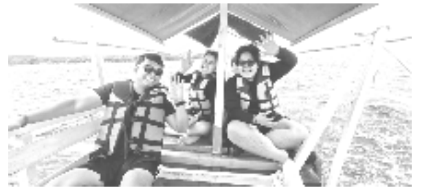
Island Hopping and Snorkeling at CaSoBe

Batangas Their next activity was a relaxing cruise on the legendary Taal Lake in Talisay, Batangas. Surrounded by the famous volcano's silhouette and the still waters of the lake, the experience was both tranquil and visually stunning. A lakeside lunch followed—featuring Batangueño favorites like crispy tawilis and lomi.