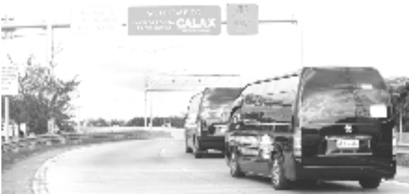
FOTON Traveller and FOTON Traveller XL cruising at CALAX

M etro Pacific Tollways South (MPT South) concessionaire of the Cavite-Laguna Expressway (CAL-AX) and Manila-Cavite Expressway (CAVITEX) marks another milestone with its flagship tourism advocacy campaign – Biyaheng South with its Summer Tour campaign. Biyaheng South Summer tour boasts of an immersive adventure showcasing Southern Luzon's finest summer destinations. This year's event is co-presented by Landco Pacific Corporation, in partnership with Department of Tourism Region IV-A (DOT IVA), Department of Interior and Local Government Region IV-A (DILG-IVA), Cavite Tourism Office and Calatagan Tourism Office. A select group of influencers, media partners, and lucky winners from the Summer Tour promotion—known as Ka-Biyaheros—were invited to experience these destinations firsthand, and who will then continue to promote