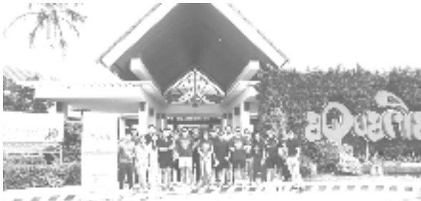
CaSoBe as the vibrant base camp for the Biyaheng South Summer Tour 2025