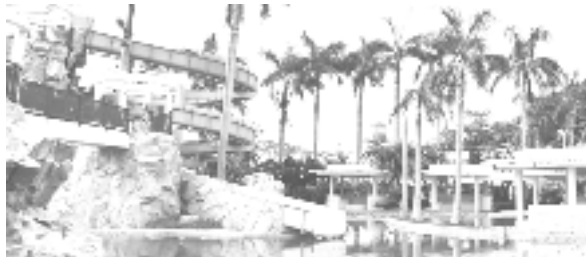
Water-filled fun at Aquaria Water Park