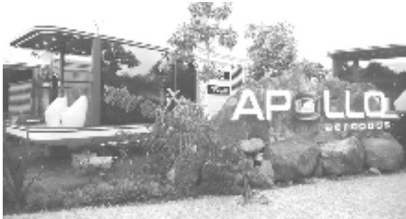
Apollo Aeropods, a unique and futuristic cabin at CaSoBe