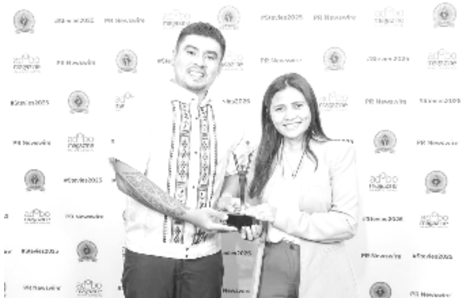
MPT South receives the prestigious Bronze Stevie® Award in Seoul, South Korea