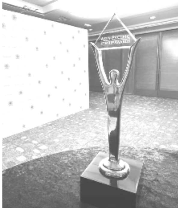
MPT South's Bronze Stevie® Award trophy for Innovation in Communications and Public Relations

S eoul, South Korea – May 13, 2025 – MPT South gained recognition as a Bronze Stevie® Award winner in the Innovation in Communications/Public Relations category, for its impactful Drayberks Road Safety Advocacy Campaign at the prestigious 12th annual Asia-Pacific Stevie Awards held in Seoul, South Korea. This esteemed accolade marks a significant milestone for MPT South, representing its inaugural Stevie® Award and underscoring the company's growing influence and commitment to exemplary advocacy initiatives such as the Drayberks Road Safety Program. The Asia-Pacific Stevie Awards stand as the premier business awards program honoring innovation across all 29 markets within the Asia-Pacific region. Globally recognized, the Stevie Awards celebrate achievements through distinguished programs like The International Business