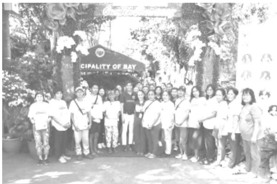
Ang mga Maghahalaman at Tanggapan ng Turismo, Kultura at Sining

Bay, Laguna — Sa luntiang anibersaryo nang ika-apat na raan at apatnapu't pitong taon (447) na pagkakatatag ng bayan ng Bay, Laguna, sumalamin ang iba't ibang programang handog sa bawat Bayeños na tumutukoy sa pagkakaisa, pagtatanghal ng mga galing at talento, paggunita sa mga hakbang tungo sa kaunlaran, at pagpapatibay ng pagkakakilanlan ng bayan bilang the Garden Capital of Laguna.