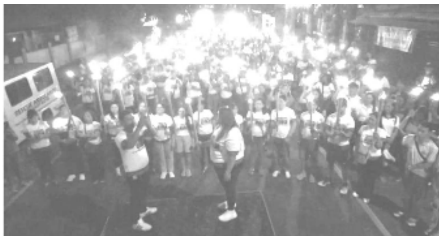
Tanglaw ng Pagsulong, Lakad ng Pagkakaisa

Bay, Laguna — Sa luntiang anibersaryo nang ika-apat na raan at apatnapu't pitong taon (447) na pagkakatatag ng bayan ng Bay, Laguna, sumalamin ang iba't ibang programang handog sa bawat Bayeños na tumutukoy sa pagkakaisa, pagtatanghal ng mga galing at talento, paggunita sa mga hakbang tungo sa kaunlaran, at pagpapatibay ng pagkakakilanlan ng bayan bilang the Garden Capital of Laguna.