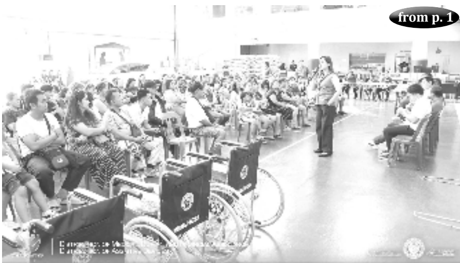
from p. 1