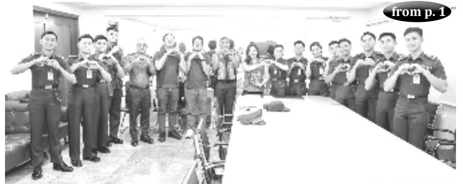
from p. 1