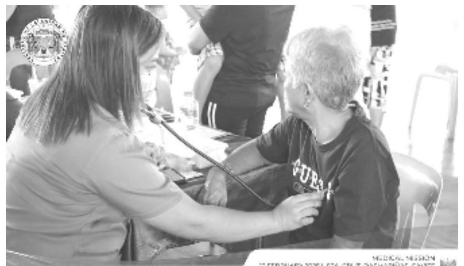
13 FEBRUARY 2025 STA. CRUZ, DASMARIÑAS, CAVITE

Gawin espesyal ang inyong Valentine's Day. Regaluhan na ang inyong mga mahal sa buhay, Imuseño!