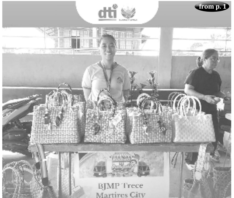
from p. 1

T he Kadiwa ng Pangulo program was successfully held at the Maragondon Municipal Covered Court on February 13, 2025, bringing fresh and affordable food products directly to the community.