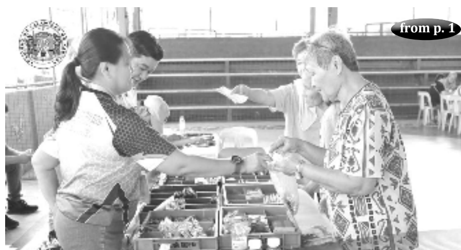
from p. 1

In a heartfelt commitment to community wellness, the Provincial Government of Cavite's medical mission team,