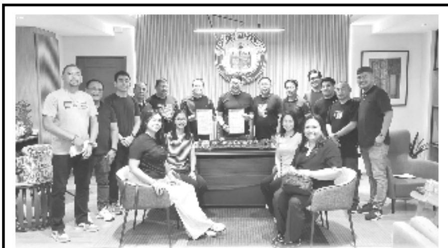
City Ordinance No. 24-72 Approved on 02 December 2024 EXEMPTING QUALIFIED SARI-SARI STORES ON THE PAYMENT OF BUSINESS PERMIT TAXES AND FEES

babalangkas ng gender-sensitive na mga plano at pondo, at ang panghihikayat sa mga mamamayan na makisisa sa pagsulong ng pagkakapantay-pantay ng mga kasarian. City Government of Imus