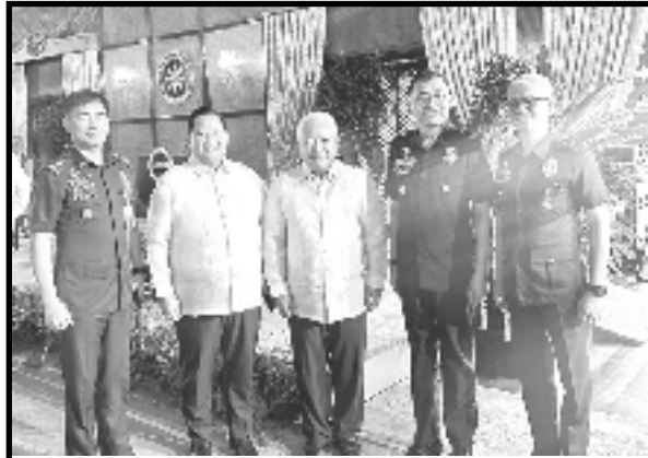
FIRE, JAIL & PNP CHIEFS ATTENDS R.A. 12024 SIGNING IN MALACANANG - Key