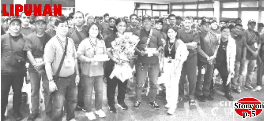
Story on p.5