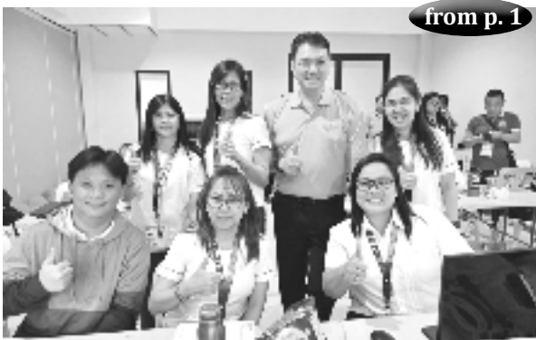
from p. 1

The training program aims to equip OCHS personnel with the skills and knowledge to utilize electronic medical records, transitioning towards paperless transactions for health records and PhilHealth claim reporting. This initiative will also include training on patient profiling, further enhancing the OCHS's ability to manage and analyze patient data. This will streamline processes, enhance efficiency, and improve the overall service delivery