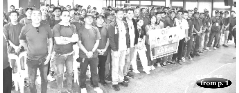
from p. 1