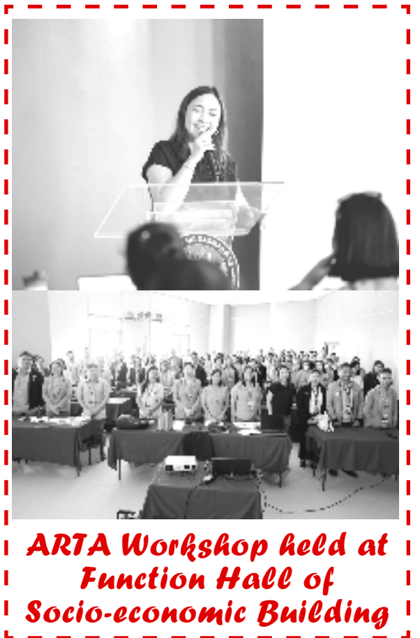
ARTA Workshop held at Function Hall of Socio-economic Building