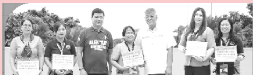
Imus LGU, nakatanggap ng High Functionality Rating sa 2024 LCAT-VAWC Functionality Assessment Ginawaran ang Pamahalaang Lungsod ng Imus ng Certificate of Recognition ng Department of the Interior and Local Government Region 4-A matapos makakuha ng High Functionality Rating sa 2024 Local Committee on Anti-Trafficking and Violence Against Women and Their Children (LCAT-VAWC) Functionality Assessment para sa taong 2023. Patunay ito sa dedikasyon ng Imus na matiyak ang kaligtasan ng mga kababaihan at bata para sa kaayusan ng kanilang pamumuhay.