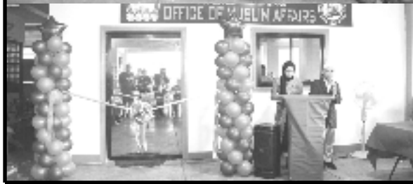
Dasmariñas City, Cavite, August 28, 2024.