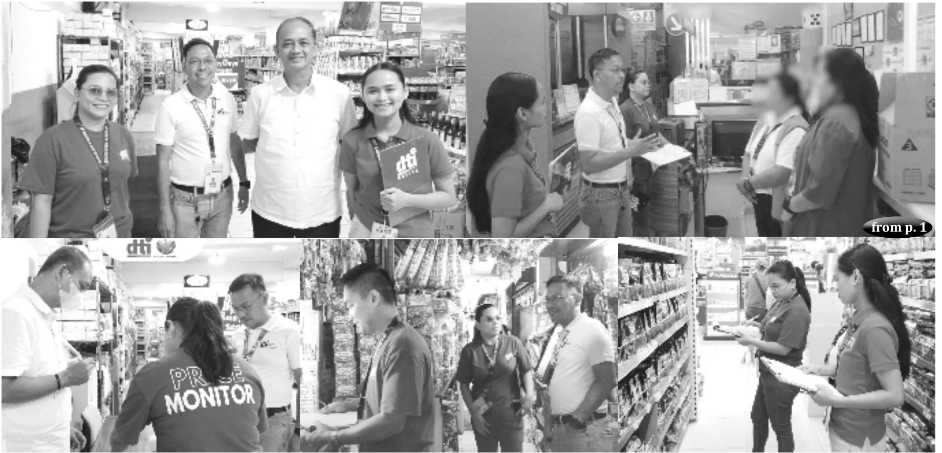
from p. 1

T he DTI Cavite Price Monitoring Team conducted on-site visits in stores located in coastal areas in Cavite. The