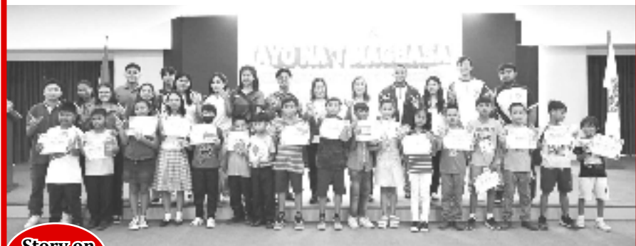
Story on p.8