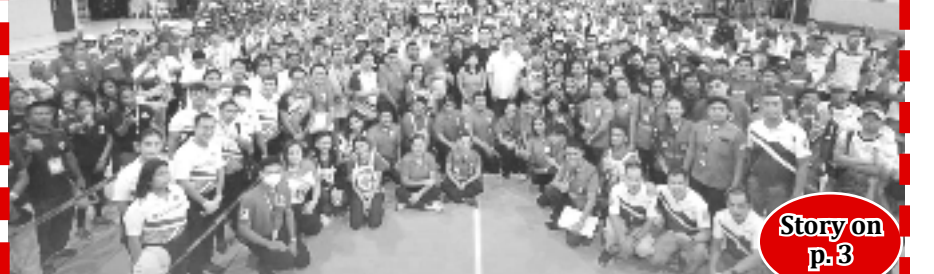
Story on p.3