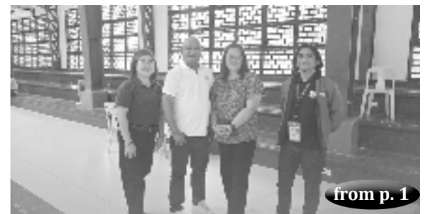
from p. 1

SOUTHERN SPARKLE NEWS AND PUBLISHING publication is an English/Filipino Weekly Published every Monday at Region IV-A, Province of Cavite