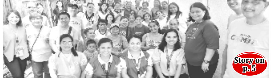
Story on p.5