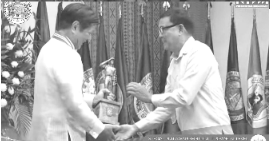
The Provincial Government of Cavite, under the leadership of Governor Jonvic Remulla, was honored with the Special Unit Award for Local Government Unit - Provincial Government Level during the 123rd Police Service Anniversary at the PNP National Headquarters, Camp Crame, Quezon City, on August 8, 2024.