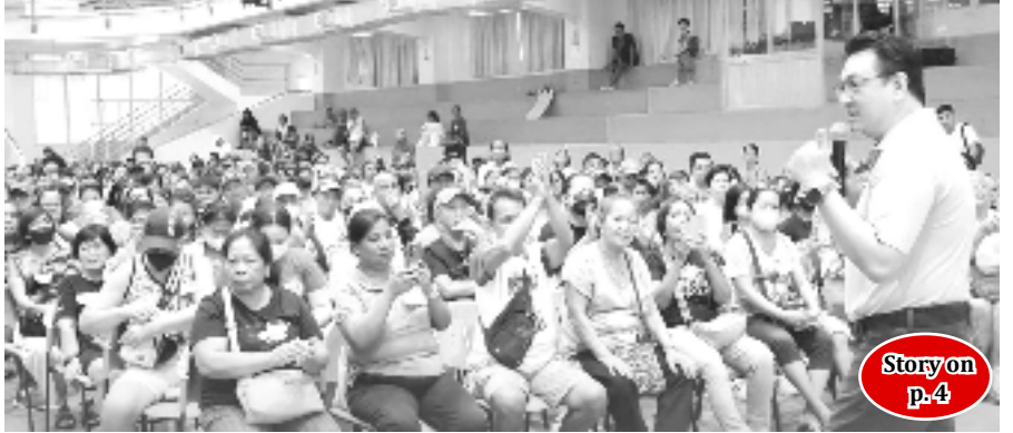
Story on p.4