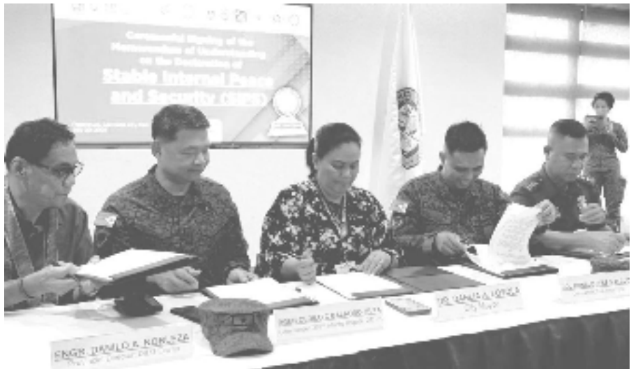
The ceremonial signing of the memorandum of understanding on the declaration of SIPS between the LGU, the Philippine Army, and Cavite PPO

C AVITE — Carmona City attained Stable Internal Peace and Security (SIPS) status, making it the first city in the province to achieve this recognition.