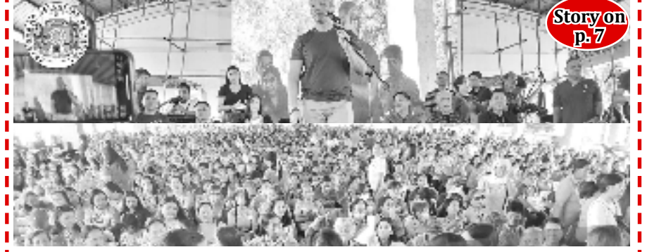
Story on p.7