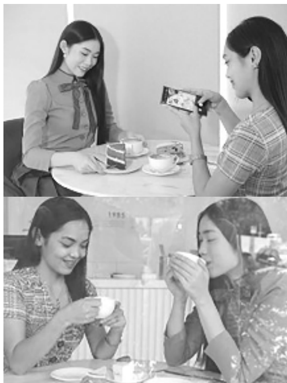
Coffee, cake, and a bestie date = perfect combo! Come treat your bestie at PaperMoon SM City Santa Rosa!

This July 1 to 14, SM malls in Laguna are taking café hopping to the next level with Coffee Fest!