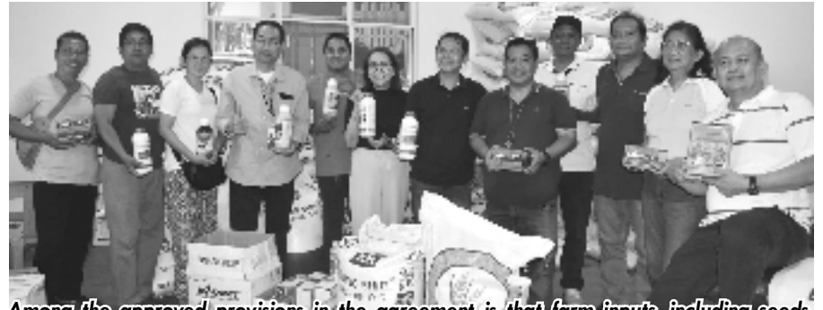
Among the approved provisions in the agreement is that farm inputs, including seeds, fertilizers, pesticides, bio-fertilizers, and cash assistance totaling P50,000 per hectare for farmers, will be awarded to IA members as a significant investment in the success of rice farming in the region.