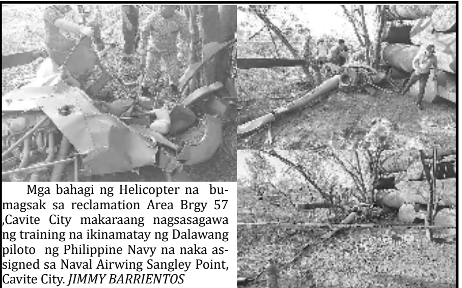
Mga bahagi ng Helicopter na bumagsak sa reclamation Area Brgy 57,Cavite City makaraang nagsasagawa ng training na ikinamatay ng Dalawang piloto ng Philippine Navy na naka assigned sa Naval Airwing Sangley Point, Cavite City.

Nakipag-ugnayan na ang pulisya sa Philippine Navy at inaalam pa kung ano ang naging sanhi ng pagbagsak ng nasabing training