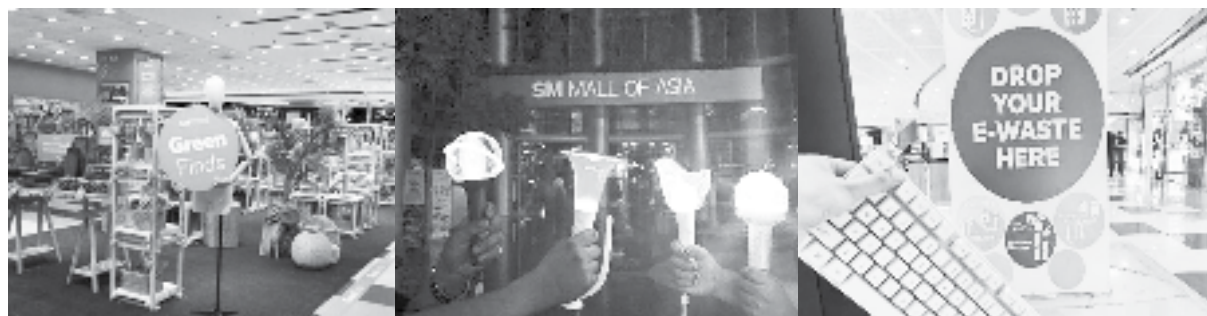
Shop for a sustainable home, dine in the dark, and recycle with SM Supermalls.

Through the collective efforts of SM Supermalls, its tenants and customers in supporting Earth Hour in 2023, SM malls saved 4825.61 kWh of energy, equivalent to CO2 emissions from charging 417,940 smartphones. Shoppers can make an impact and #GiveAnHourForEarth at SM malls, showcasing how raising awareness on the climate crisis can be a vibrant and enjoyable experience too. (Karen Christine H. Tiqui)