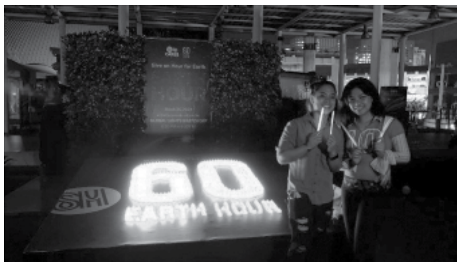
Mall goers are invited to take small actions and make a big difference during Earth Hour at SM malls.

Small actions can make a big difference. This year, SM Supermalls invites everyone to #GiveAnHourForEarth by joining millions around the world in the annual Global Lights Switch Off on March 23 from 8:30pm to 9:30pm. This 2024, SM marks 16 years of commitment in supporting the annual campaign initiated