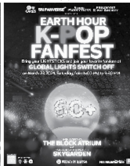
Check out an SM mall near you for interactive activities on Earth Hour this March 23.