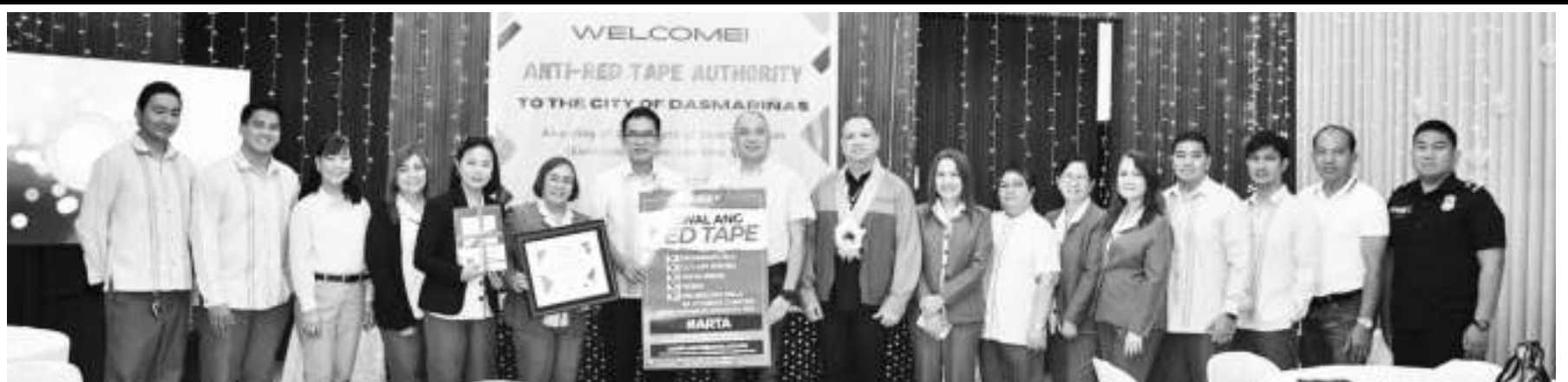
Awarding of Certificate of Commendation of Anti-Red Tape Authority (ARTA) to the City of Dasmariñas Electronic Business One Stop Shop (eBOSS) held last Tuesday, 5 March 2024

This is to recognize the City of Dasmariñas for being one of the first cities who complied and successfully implemented an automated online operational processing of business permitting and licensing procedures. The City's effort to adapt change has set a standard that will resonate throughout the nation.