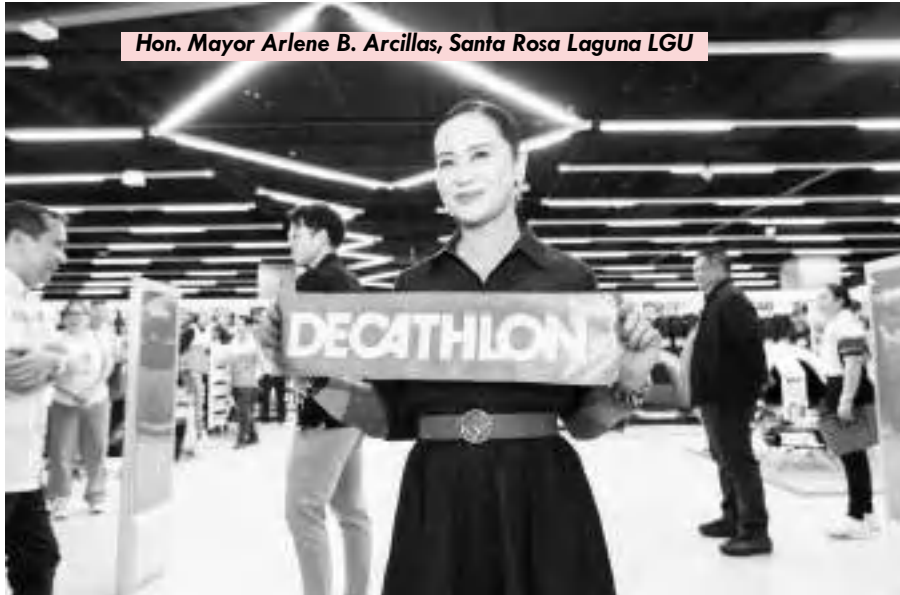
Hon. Mayor Arlene B. Arcillas, Santa Rosa Laguna LGU