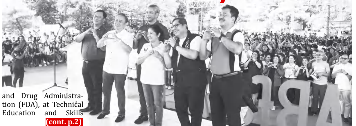
and Drug Administration (FDA), at Technical Education and Skills (cont. p.2)

Pinangunahan ni First Lady Louise Arana-Marcos ang pamamahagi ng iba't ibang tulong at serbisyo mula sa mga ahensya ng pamahalaan kagaya ng Department of Health (DOH), Department of Agriculture (DA), Food