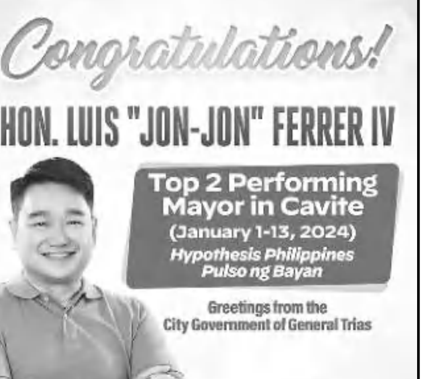
Let's join Forces For a Mare Progressive Catifi

Matapos ang inagurasyon, nagdaos ng (cont. p.9)