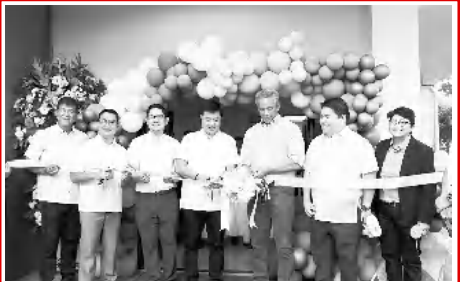
Dinaluhan po ng inyong lingkod Mayor Alex 'AA' Advincula ang Inagurasyon at Pagbabasbas ng Regional Trial Court Annex Building (Old LTO Building) at New Municipal Trial Courts in Cities Building (Formerly Imus Vocational and Technical School). Nakasama naman po sa programang ito sina Vice Mayor Homer Saquilayan at Gov. Jonvic Remulla. Ayon kay Mayor Alex Advincula, "Sinisiguro po namin na sa pamamagitan ng mga bagong pasilidad na ito ay mas paigingtingin natin ang proteksyon ng bawat isa na walang kasalanan."