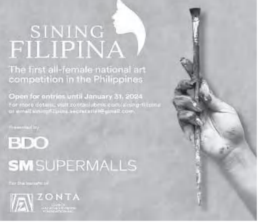
Entries for Sining Filipina, the pioneering all-female national art competition in the Philippines, are being accepted until January 31, 2024.

This groundbreaking competition aims to provide a platform for (cont. p.4)