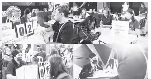
Bridging job seekers with exceptional career prospects, Sangguniang Kabataan Provincial Federation of Cavite, in partnership with the Office of the