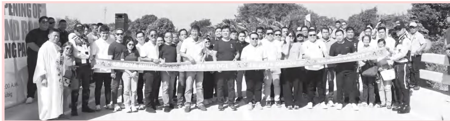
Pinangunahan po ni Imus City Mayor Alex AA Advincula ang Blessing at Inauguration ng bagong daan at tulay sa La Joya, Bahayang Pag-Asa, Brgy. Buhay Na Tubig na magagamit na ng ating mga kababayan. "Umasa po kayo na madadagdagan pa ang mga ganitong klaseng proyekto upang mabawasan ang kinakaharap nating suliranin tungkol sa trapiko." ayon kay Mayor Advincula.