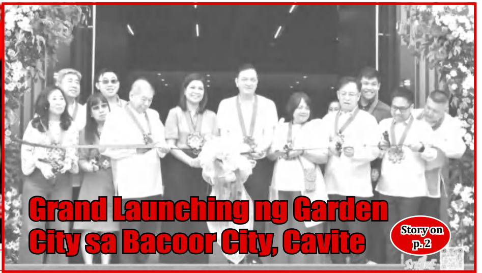
Grand Launching ng Garden City sa Bacoor City, Cavite