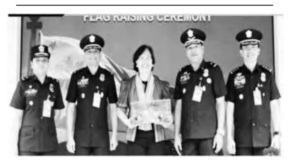
BFP CSC FIELD OFFICE DIRECTOR CONFERS PRIME-HRM BRONZE AWARD

BJMP BAGS GOLD TRAILBLAZER AWARD –The Bureau of Jail Management and Penology (BJMP) bagged the Gold Trailblazer Award and was conferred the Initiation Status under Institute for Solidarity in Asia's (ISA) good governance framework, the Performance Governance System (PGS). The Jail Bureau unveiled two innovative core processes to address overcrowding, reoffending, and other pressing issues within Philippine jails during a public revalida on September 28, 2023. The public revalida is a democratic exercise that validates the public institutions' completion of the four stages of the PGS.