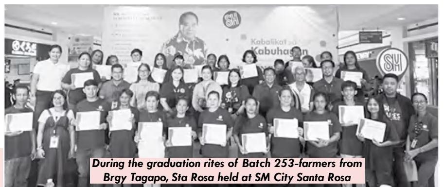
During the graduation rites of Batch 253-farmers from Brgy Tagapo, Sta Rosa held at SM City Santa Rosa

A total of 75 farmers from Laguna are now equipped with new knowledge and skills about farming after they have completed the 14-week training of SM Foundation Inc.'s Kabalik sa Kabuhayan Farmers' Training Program. (cont. p.7)