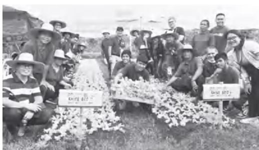
Batch 252 of farmer trainees during the harvest of their high-value organic crops in Brgy San Lucas 1, San Pablo Laguna.