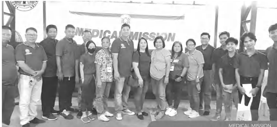
MEDICAL MISSION AUGUST 23, 2023 | BARANGAY TEJERO, CTC WWW.CAVITE.GOV.PH - WWW.SONVICREMULLA.COM