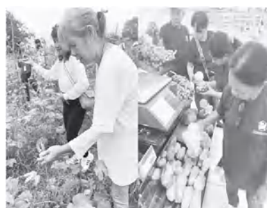
During the harvest and SM Markets tour of Batch 251 farmers from Brgy Banlic Calamba City, Laguna