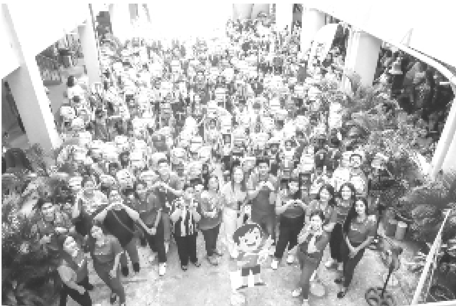
Students of Col. E. De Leon Elementary School in Paranaque received free school supplies to kick off this year's Brigada Eskwela.

M etro Pacific Tollways South (MPT South), a subsidiary of Metro Pacific Tollways Corporation (MPTC), stands in solidarity with the nation during the annual Brigada Eskwela, as public schools prepare to resume classes this month.