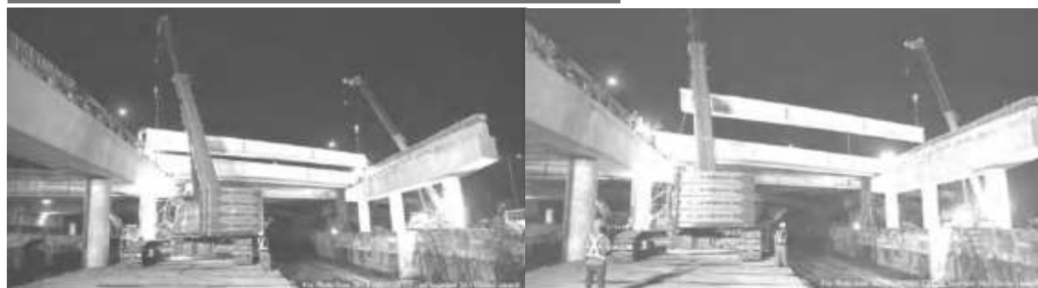
Actual photo of girder launching activity for CAVITEX C5 Link last 2018 over SLEX. Similar activity will be done at CAVITEX Parañaque (near Toll Plaza) for CAVITEX C5 Link R1 Interchange construction. During the girder launching activity starting September 15 to 24, 2023, counterflow lane will be activated for all vehicle classes.

cessionaire of the Manila-Cavite Expressway (CAVITEX), is set to commence the girder launching activity for the CAVITEX C5 Link Segment 2 R1 Interchange.