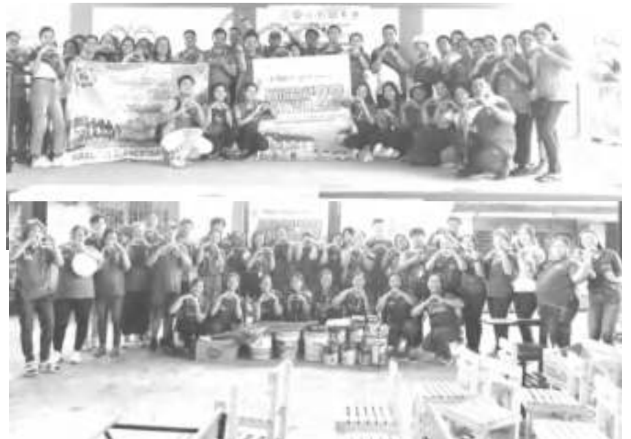
MPT South Volunteers pose with school officials and other community volunteers during Brigada Eskwela at Tibig Elementary School, Silang, Cavite (L) and Gahak-Marulas Elementary School, Kawit, Cavite (R).

Earlier this month, the Department of Education (DepEd) inaugurated the 2023 Brigada Eskwela, or Schools Maintenance Week, under the banner of "Bayanihan Para sa Matatag na Paaralan."