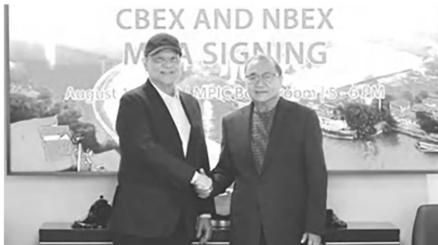
MPTC Chairman Manuel V. Pangilinan (right), signs a Memorandum of Agreement with SMC Chief Executive Officer Ramon S. Ang (left) to design, build, and operate CBEX and NBEX.

P ASIG, Philippines, 14th August 2023 – Metro Pacific Tollways Corporation (“MPTC”), the tollways infrastructure unit of Metro Pacific