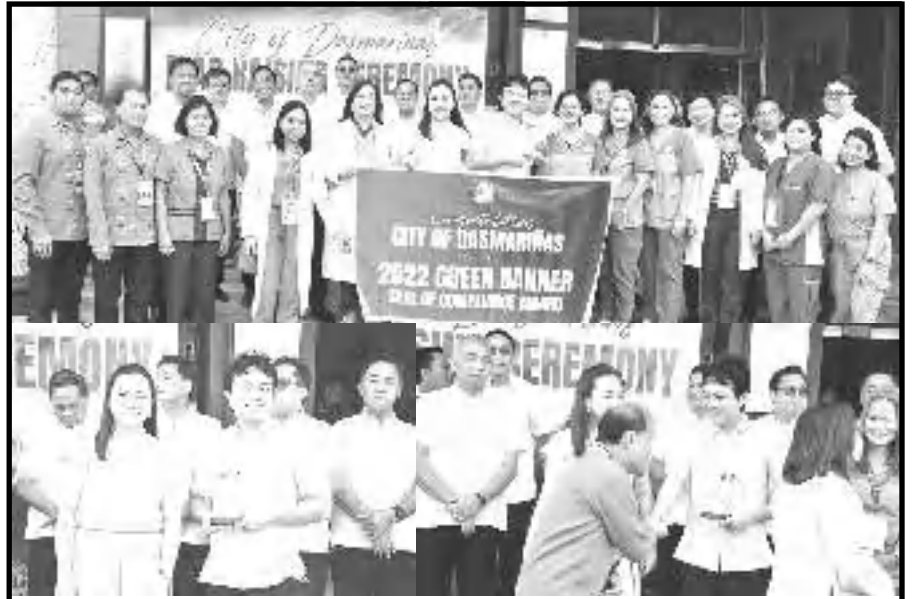
The City of Dasmaringas has been awarded the 2022 Green Banner Seal of Compliance by the Calabarzon Regional Sub-Committee on Nutrition during the 2023 Regional Nutrition Awarding Ceremony held at Seda Nuvalu, Sta. Rosa City, Laguna last August 1, 2023