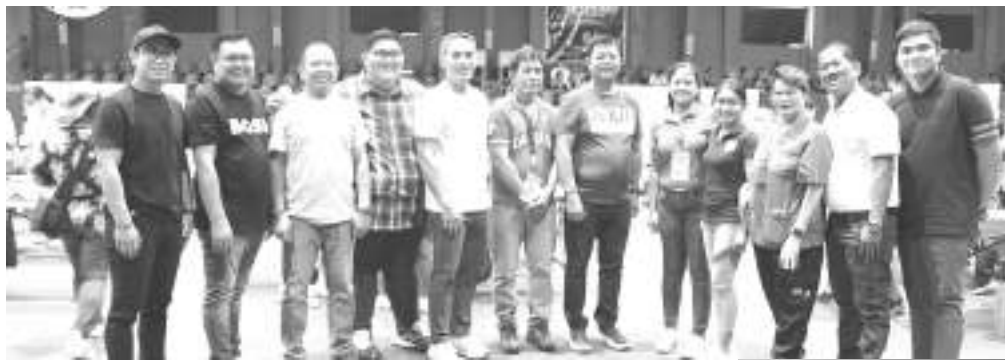
The Office of the Provincial Governor – medical mission team in partnership with the City Government of Imus and Congressman AJ Advincula, conducted a successful Operation Tuli for the young males of the city held at Imus Sports Complex on July 18, 2023.

A total of 206 beneficiaries availed the free circumcision rendered by the medical professionals from the City Health Office and Office of the Provincial Health Officer. Mayor Alex Advincula and some Sangguniang Panglungsod members were also present and expressed their support for the healthcare initiative.(PICAD)