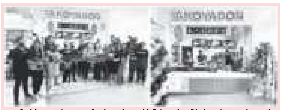
Satisfy your Japanese food cravings with Takoyadon. Dig into the mouthwatering selection of Takoyaki, Yakisoba, Donburi and Udon. Head over to SM City Calamba and have a gastronomic journey at Takoyadonlocated at SM Foodcourt2nd level. (KCHT)

the world, specifically children, walk barefoot as they lack financial resources to avail themselves of decent foot-(cont. p.5)