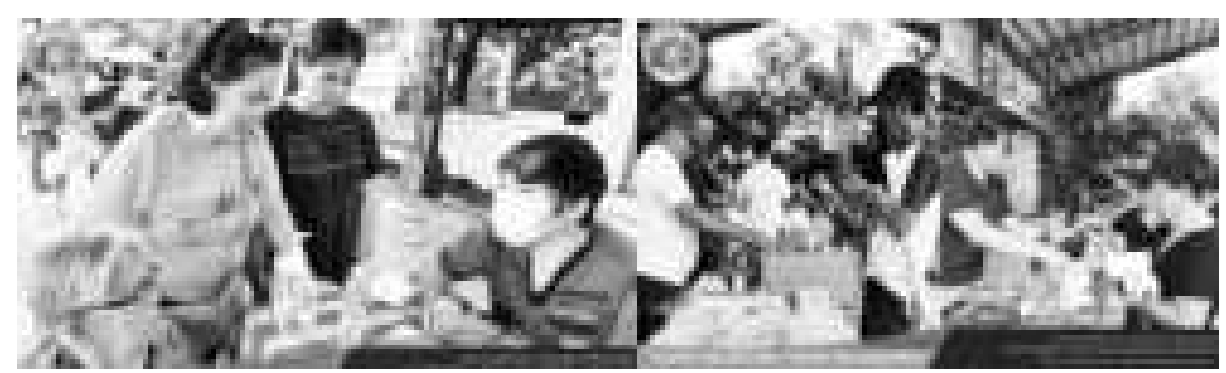
Another leg of medical mission unleashes hope for the residents of Noveleta. Starting the month on another health track, the compassionate team from the Provincial Government of Cavite revisited the Municipality of Noveleta on September 1, 2023, leading to renewed health and hope for 242 residents from Barangay San Antonio.

Free basic healthcare services and medications were given by the Office of the Provincial Governor (OPG) and Office of the Provincial Health Officer (OPHO) to the locals in dire need, easing their physical and financial concerns. Aside from these, a random blood sugar (RBS) test was also provided to check the glucose level of patients and help combat diabetes.(CPIO)