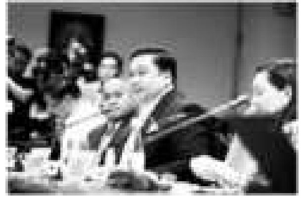
PROBE ON PERSISTENT INCURSIONS IN THE WEST PH SEA : Senator Jinggoy Ejercito Estrada, Chairperson of the Senate Committee on National Defense and Security, inquires on the actions taken so far by the Executive branch on persistent incursions in the West Philippine Sea by the Chinese Coast Guard and militia vessels during Estrada's Committee Hearing on September 12, 2023.