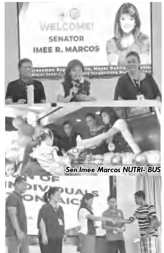
Sen Imee Marcos NUTRI-BUS

ernment for programs that are appropriate and needed for each municipality and even disclosed her insight on the vicious cycle of rice importation happening in the country and suggested the proper analysis using the right data from the government agencies concerned to address the problem of increasing price of rice. (MARGIE BAUTISTA)