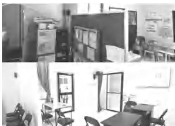
Before and after: SMFI and UNIQLO Philippines upgrade the Brgy. Canlalay Health Station

N ot just one but two highly destructive typhoons had hit the Brgy. Canlalay in Biñan, Laguna over the past years. Following the onslaught of Ondoy, the humble community was also devastated by the severe tropical storm Paeng.