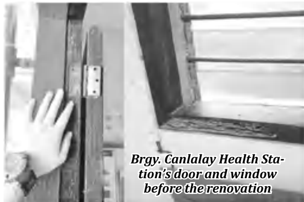
Brgy. Canlalay Health Station's door and window before the renovation