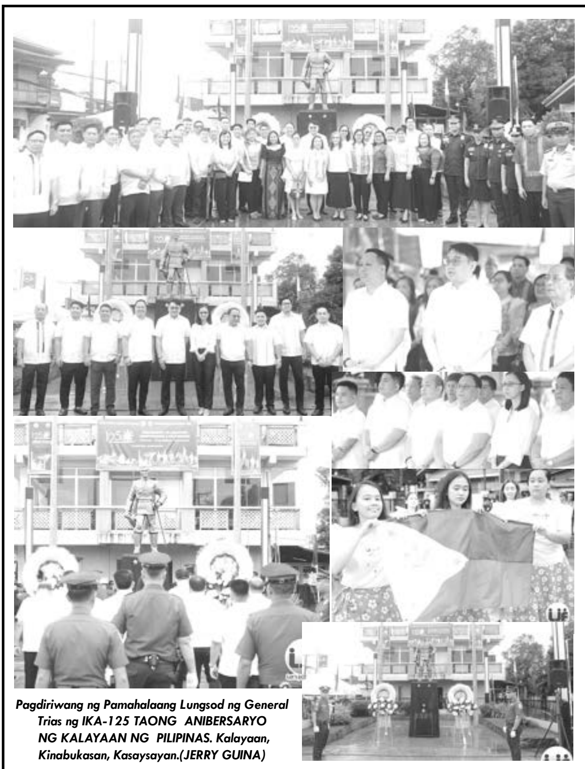
Pagdiriwang ng Pamahalaang Lungsod ng General Trias ng IKA-125 TAONG ANIBERSARYO NG KALAYAAN NG PILIPINAS. Kalayaan, Kinabukasan, Kasaysayan.

Kumibinido naman nag pamilya ng biktima na walang naganap na foul play sa insidente kung kaya pumirma sila ng waiver na hindi na sila interesado sa isasagawang awtopsiya sa biktima.