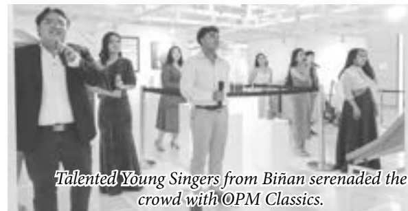
Talented Young Singers from Binan serenaded the crowd with OPM Classics.