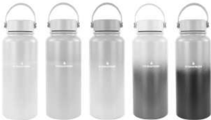
Another useful item you can give them this Christmas is a Hydrofresh Stainless Steel Tumbler. It comes in Ombre and Metallic collections which can also complete their daily fit because of its stylish looks.