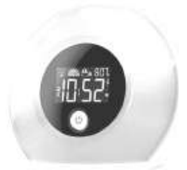
You may create a gift set together with a Bluetooth Speaker with Alarm Clock and LED Light for entertainment and function. It plays up to 10 hours and has a color changing light complete with a functional alarm clock.