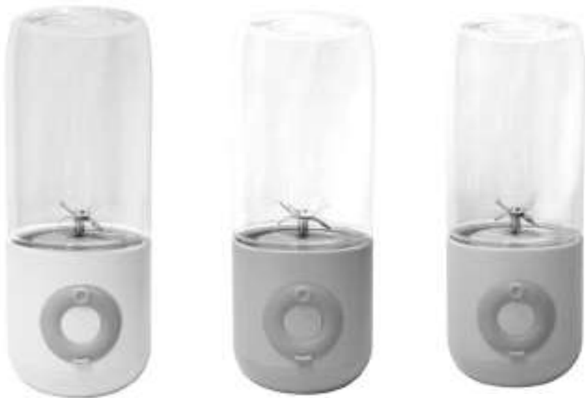
Add more grab-and-go items Make your always on-the-go friends live a healthier lifestyle by giving them functional yet easy-to-use Portable Juicer. It comes with a button panel multipurpose blender to make their own delicious juices, smoothies, or even milkshakes.