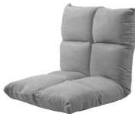
Put together a comfy nook Nothing beats useful items built for comfort and ease. Help your friends create a cozy corner at home with a Tatami Floor Chair that has breathable cotton fabric and high-quality cushion perfect for lounging. It also comes in various colors to match every personality.