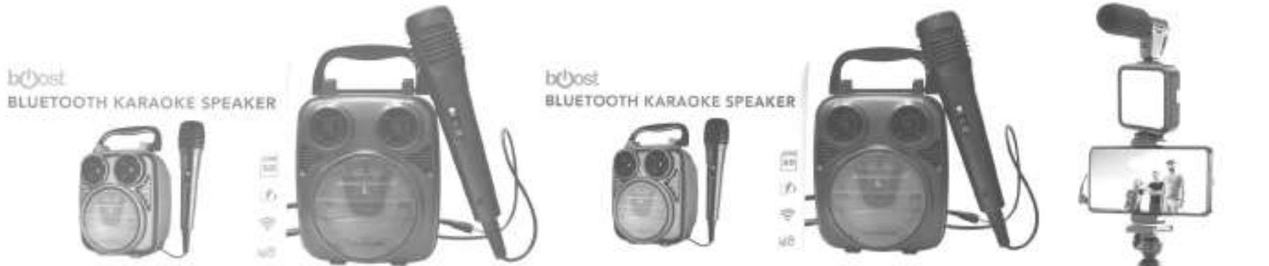
Make them the life of the party Surprise your fun-loving friends with a Bluetooth Karaoke with Microphone that they can use in every party. This one-of-a-kind Bluetooth Karaoke is easy to carry with its built-in handle, and to connect to other Bluetooth electronic devices for wireless audio link.