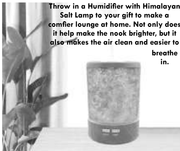
Throw in a Humidifier with Himalayan Salt Lamp to your gift to make a comfier lounge at home. Not only does it help make the nook brighter, but it also makes the air clean and easier to breathe in.

and ShopSM. Surplus Order to Deliver is also now available; join their Viber community and follow them on Facebook and Instagram @SurplusPH and @Surplus_ph for more details.### (KCHT)