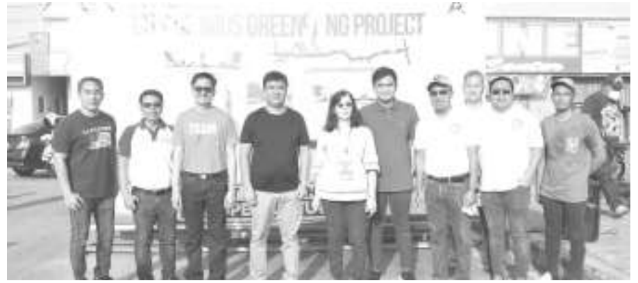
Nakiisa si Mayor Alex Advincula sa proyektong Tree Growing ng ating Pamahalaang Lungsod sa pangunguna ng City Environment and Natural Resources Office (CENRO). Hinihikayat nya ang bawat isa na ingatan at panatilihin maayos ang ating kapaligiran lalo na ang ating kalikasan.