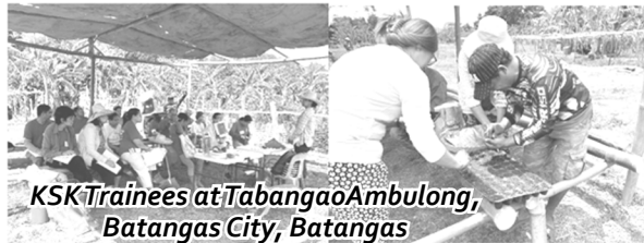
KSK Trainees at Tabangao Ambulong, Batangas City, Batangas

S M Foundation, Inc. (SMFI) has taken another step in its mission to enhance the agriculture and entrepreneurial skills of farmers. The organization recently launched the KabalikatsaKabuhayan on Sustainable Agriculture Program (KSK-SAP) across various locations in Calabarzon.