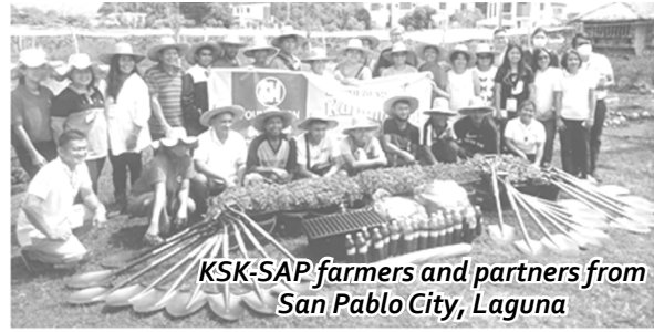
KSK-SAP farmers and partners from San Pablo City, Laguna