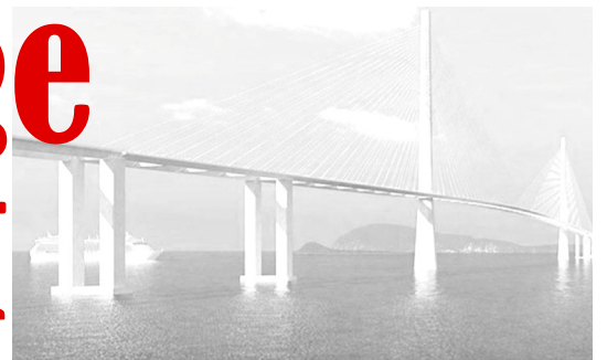
An artist's perspective of Bataan-Cavite Interlink Bridge project

MANILA – The construction of the PHP175.7-billion Bataan-Cavite Interlink Bridge Project will start towards the latter part of the year, the Department of Public Works and Highways (DPWH) said Tuesday.