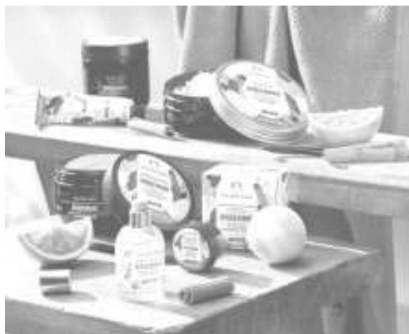
NEW LIMITED EDITION SPICED ORANGE. Like a warm, cozy hug, the new limited edition Spiced Orange body care collection brings pure comfort. These skin-loving treats are infused with orange rind essential oil, known for its relaxing scent. And it's all topped off with the scent of baked spices and vanilla to immerse you in festive nostalgia.