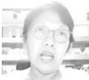
Patuloy na nakaalerto ang lokal na pamahalaan sa banta ng