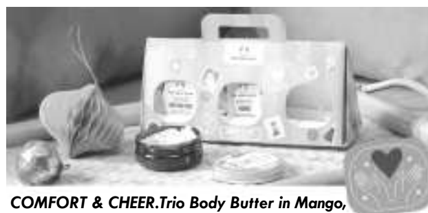
COMFORT & CHEER. Trio Body Butter in Mango, British Rose, and Shea.