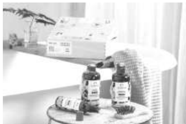
FOR HAIRCARE OBSESSIVES. For someone who deserves some serious pampering, the Sparkle and Shine Hair care gift packs a shampoo, conditioner, hair mist and mini brush, this gift set is perfect for anyone who wants more radiant hair this Christmas.

is to build starter classrooms for the children of Salat High School, Cotabato. These are available at The Body Shop stores and on its online store www.thebodyshop.com.ph