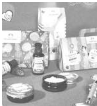
FOR BODY CARE FANS. They'll love these novelty sets of creamy, moisturizing body care routine for all skin type, found in our reusable paper vanity sets.