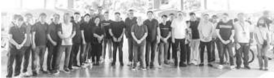
Nasa 29 na residente ng lungsod ng General Trias ang nabigyan ng suportang pangkabuhayan kamakailan sa pamamagitan ng Nego-Kart Project ng Department of Labor of Employment (DOLE) at lokal na pamahalaan nito.(GO CAVITE)