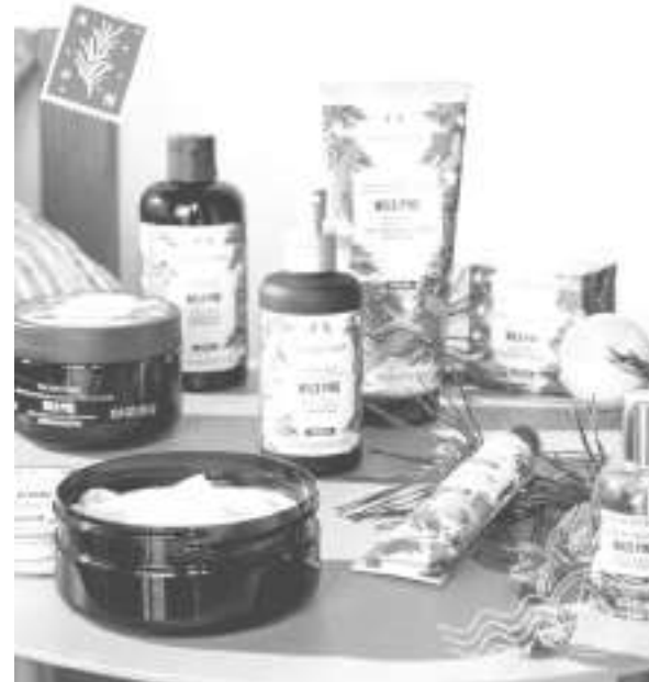
NEW LIMITED EDITION WILD PINE. Ever feel like escaping from the busyness of the season? Now you can with the new limited edition Wild Pine body care collection. Infused with pine essential oil, this crisp clean scent will transport you to a fresh pine forest and help revive the senses. Plus, the collection packs a moisture hit to cuddle dry skin.

It doesn't stop at Community Fair Trade partners, either. This year, with every purchase you make at The Body Shop customers also supports Yellow Boat of Hope Foundation for its 3rd year and this time our goal