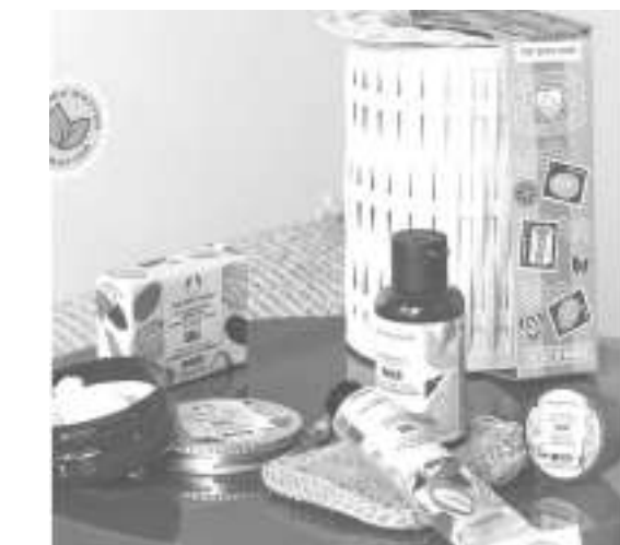
FOR SKINCARE ADDICTS. Elevate your skincare routine with the Fresh & Festive Edelweiss gift. Enriched with edelweiss extract, this skincare set leaves skin feeling stronger* and smoother (even after one too many late nights).

From vegan beauty surprises to more indulgent premium gifts, The Body Shop has