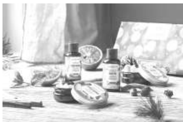
Why not transport them to a festive wonderland, with the Cheer & Wonder Orange & Pine Mini Collections, it's the perfect way to sample The Body Shop's new limited edition ranges.