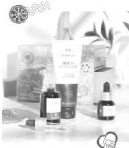
comes in a handwoven, reusable paper basket crafted by Community Fair Trade partners in Nepal. It's a gift you can feel really good about giving.