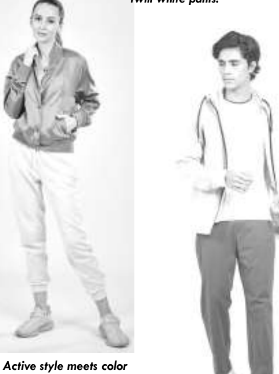
with this yellow bomber jacket worn with jogger pants Whether you're