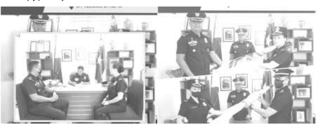
TURN OVER CEREMONY OF COMMISSIONED OFFICERS: The Bureau of Fire Protection Region IV-A conducts turn over ceremony of Commissioned Officers held recently at the Regional Office Camp Vicente Lim, Laguna.

In response to the demands of modernization, a modern 5-story building is to be constructed to house the BFP regional headquarters in Surigao City as envisioned by the incumbent regional director. A step in making it into reality is through the signing of an MOU.