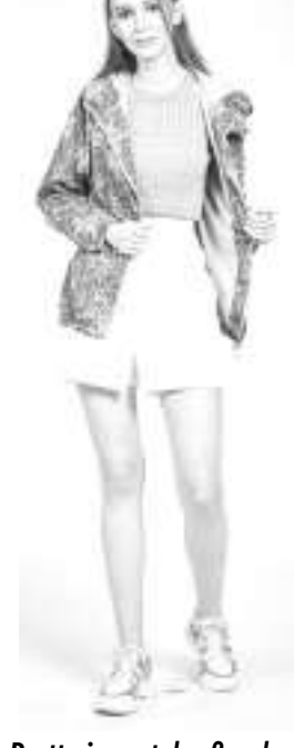
Pretty in pastels: floral printed full zip jacket, knitted cropped top, and twill shorts.

The Surplus coat and jacket collection is available in Surplus stores in most SM malls nationwide.