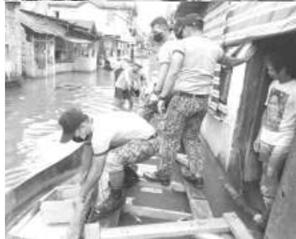
Bagyong Paeng sa lungsod ng Binan.