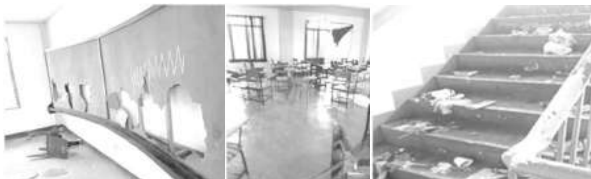
VANDALIZED MUNTINLUPA SCHOOL — A destroyed blackboard, disarrayed classroom and trash left at a public high school in Muntinlupa used by evacuees at the height of severe tropical storm "Paeng".

Fifty-five jail officers of the Bureau of Jail Management and Penology and five correctional officers from the Bureau of Corrections had just completed the 75-day Special Tactics and Response (S.T.A.R.) Course Training at Brgy. Vista Alegre, Barotac Viejo, Iloilo. The program is one of the high-risk operational trainings of the BJMP which includes firearms proficiency, unarmed combat, close quarter battle, and other skill building activities that serves as foundation of jail officers aspiring to become part of the elite squad group. During the graduation ceremony on November 2, six trainees were ranked as sharpshooters while 54 others are classified as marksmen in the BJMP Firearms Proficiency Classification.