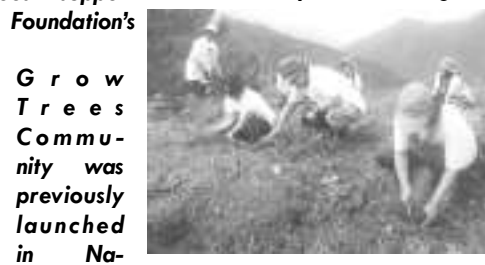
People's Organization NAMALISA plant trees at the launch of Grow Trees Community in Tuba, Benguet

s e n in field. sugbu, Batangas and Macabebe, Pampanga. To fur-Across the three locations, the project aims to ther plant over 200,000 seedlings and propagules.