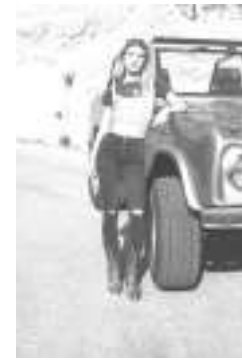
Get ready for some fun and adventure in school with F21's bustier crop top and distressed skinny jeans.