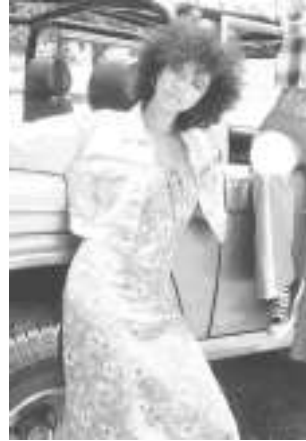
Everything Elle. Wear a cropped denim jacket with a floral print midi dress for a cool and relaxed day in school. Available at Forever 21.