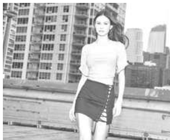
Sofia Style: casual and trendy bustier cropped top paired with a lace-up mini skirt from F21.