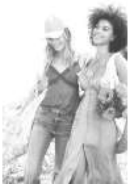
Romantic, bohemian, and forever feminine. Forever 21's satin lace trim-cami, distressed flare jeans, plaid button-up shacket, cami midi dress and crochet vest.