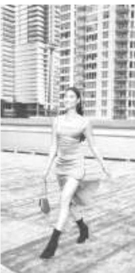
Belle of the ball. F21's satin midi dress with o-ring faux leather shoulder bag.