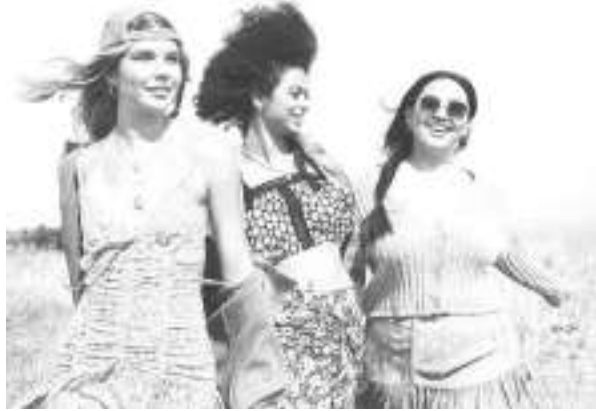
Pretty and preppy. Cropped cardigan sweater, floral print cropped top and skirt, ruched floral print mini dress, hoop earrings and round-frame sunglasses.