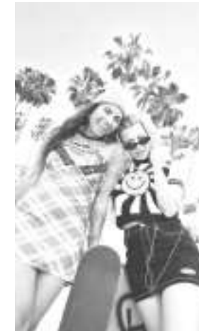
Back to school grunge: plaid cami mini dress, happy face sweater vest, mini skirt and oval framed sunglasses. All available at F21.