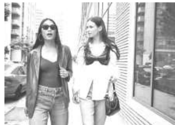
Downtown luxe. A double-breasted blazer paired with a mini skirt and a baguette shoulder bag from Forever 21.

W ith face-to-face classes, back after two years of virtual learning, it's time to say