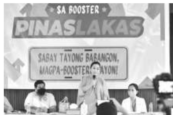
pupulong ay tungkol sa PINASLAKAS CAM-