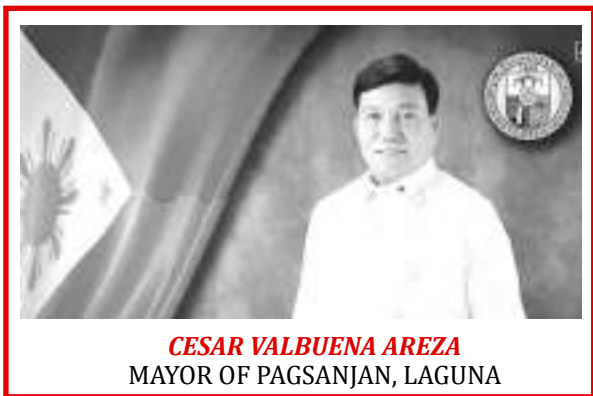
CESAR VALBUENA AREZA MAYOR OF PAGSANJAN, LAGUNA