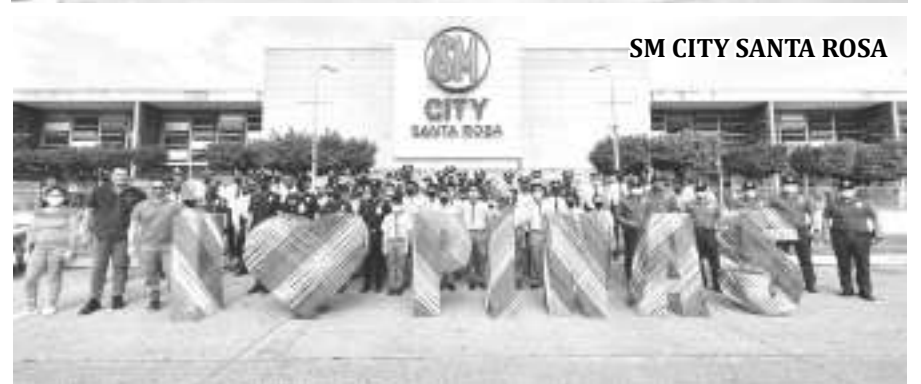
SM CITY SANTA ROSA

Southern Sparkle News And Publishing June 20, 27 & July 4, 2022