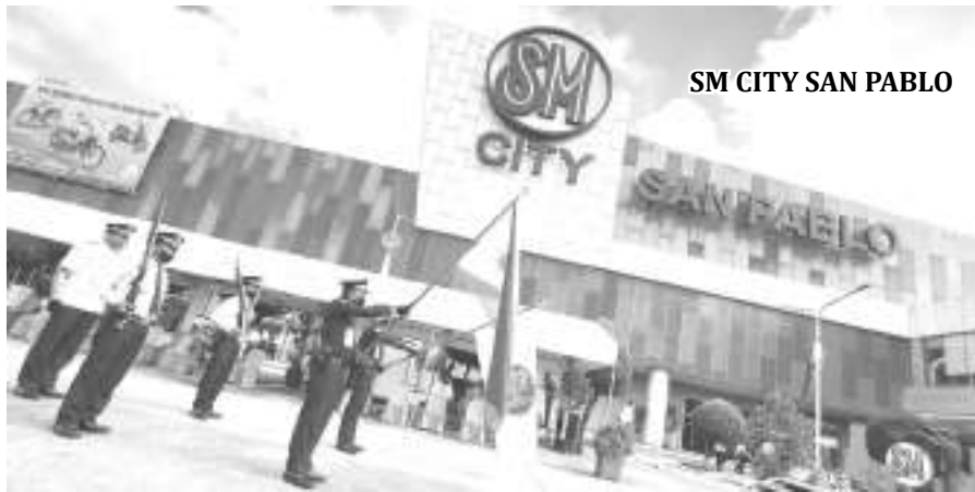
SM CITY SAN PABLO