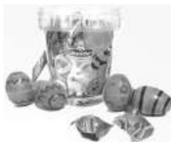
Egg-citing Treat from Dutche Chocolate only from SM Snack Exchange.