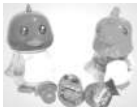
Easter Chick Candy Jar from SM Snack Exchange.