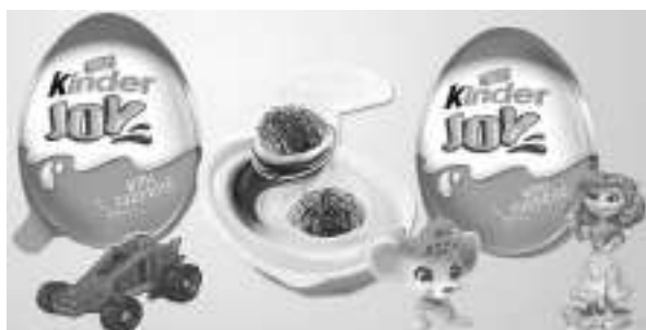
Hop in for a sweet and Easter surprise toy with Kinder Joy.

E aster makes a stop at SM! And bunnies, toys, chocolates, candies and lots of egg-citement celebrate the hope and new life that comes with spring and Christ's resurrection.