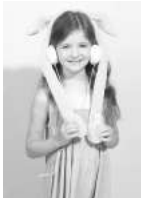
Have a delightful and cool Easter with this fashionable AXCS Plush Bunny wired and adjustable Headphones. Available in pink, white and purple color at the Kids' Accessories Department at The SM Store.