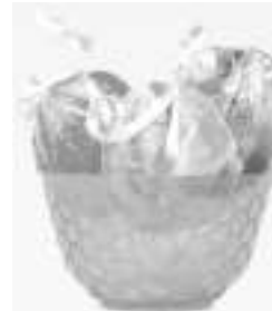
Colorful swirl egg-shaped hard candies add a new twist for your egg hunting experience.