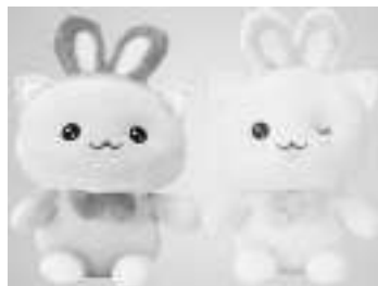
To hug and to hold. Fluffy Kawaii Bunnies from Toy Kingdom.