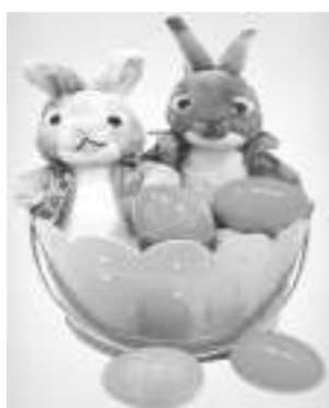
There's a lot of egg-citement in Easter Egg Hunting with these colorful eggs, bucket and a Peter Rabbit plush. Items are sold separately at Toy Kingdom