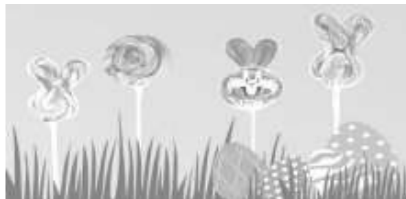
Tuck a bouquet of these Swirl Pops to your Easter basket.