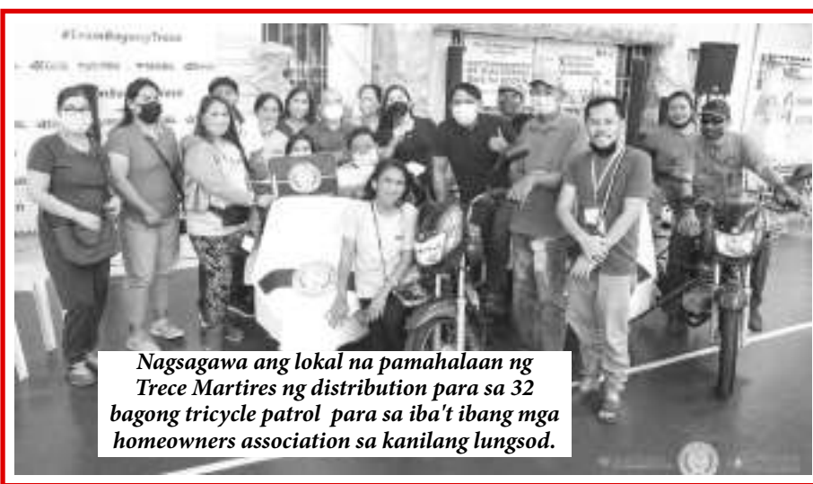
Nagsagawa ang lokal na pamahalaan ng Trece Martires ng distribution para sa 32 bagong tricycle patrol para sa iba't ibang mga homeowners association sa kanilang lungsod.