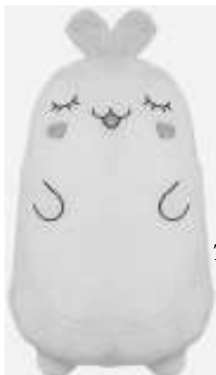
Adorable 60cm Plush Cuddle Rabbit buddy from AXCS at Kid's Accessories Department at The SM Store.